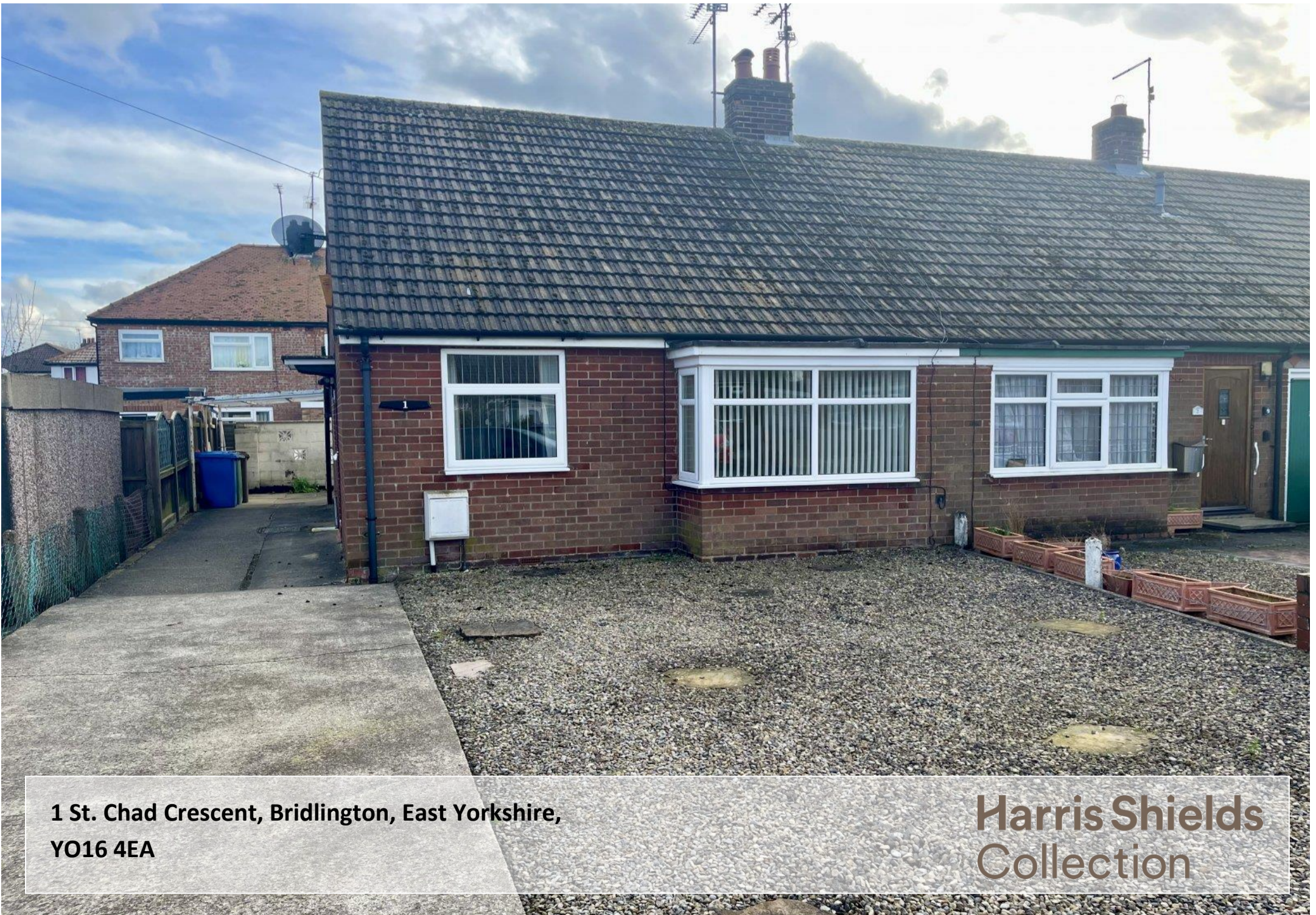
1 St. Chad Crescent, Bridlington, East Yorkshire, YO16 4EA